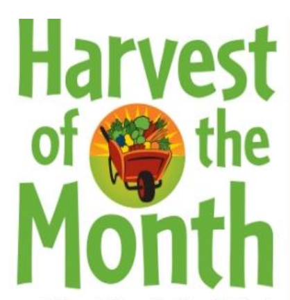
Network for a Healthy California